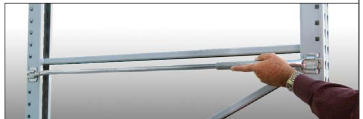
Spring-loaded Fluekeeper is easy for maintenance personnel to install from the aisle side of the rack - requires no special tools or skills

FlueKeeper from DACS US Patent #7,857,152