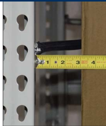
Provides 3" clearance between rack and stored material