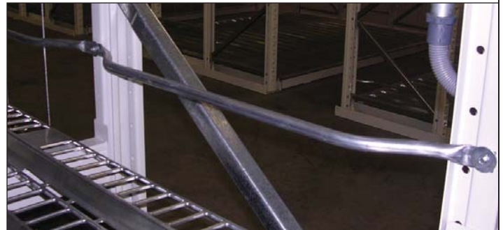
Fixed-length Fluekeeper® installs easily with TEK® screws

FlueKeeper® from DACS US Patent #7,857,152