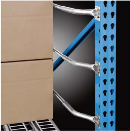
Mechanical guard for transverse flue spaces